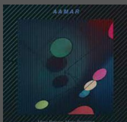
MORE POSION, MORE PARADISE